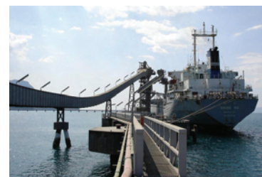
▲水泥船達和輪於台灣花蓮港裝貨 MV Ta-Ho (Cement Carrier) loading at Hua-lian Port, Taiwan